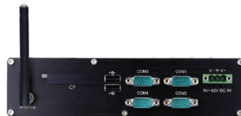
MXE-3000 with Antenna