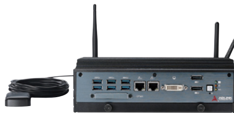
MXE-5400 with Antenna